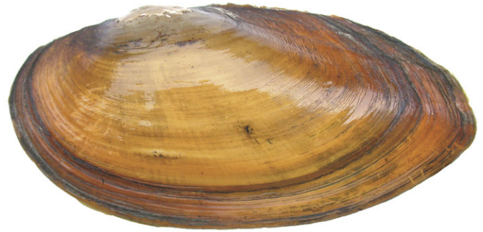
Alewife floater ( Anodonta implicata ).

The alewife floater is often abundant in Atlantic coastal rivers and lakes, and its distribution is closely tied to, and dependent upon, the alewife. If a dam blocks alewives from reaching historical spawning grounds, then the alewife floater will go extinct in upstream areas. Some evidence suggests that the alewife floater was extirpated in several coastal watersheds in the last four centuries. For example, it is noticeably absent in rivers and lakes of southern coastal Maine, where dams were built as early as 1634. Anadromous fish migrations were halted decades and even centuries before scientists could document fish or mussel populations in some watersheds. A quotation from the 1867 Fish Commissioner’s Report, referring to salmon in the Saco River, is particularly telling: “We could obtain no estimate of their numbers in former times, as they had ceased to be plenty beyond the recollection in the present generation.”