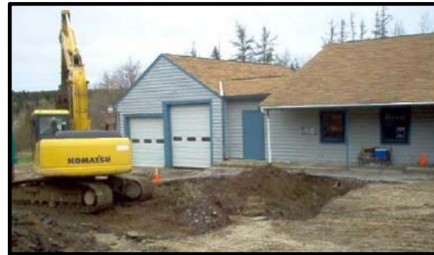
Investigation and Remediation of petroleum, mercury, and asbestos