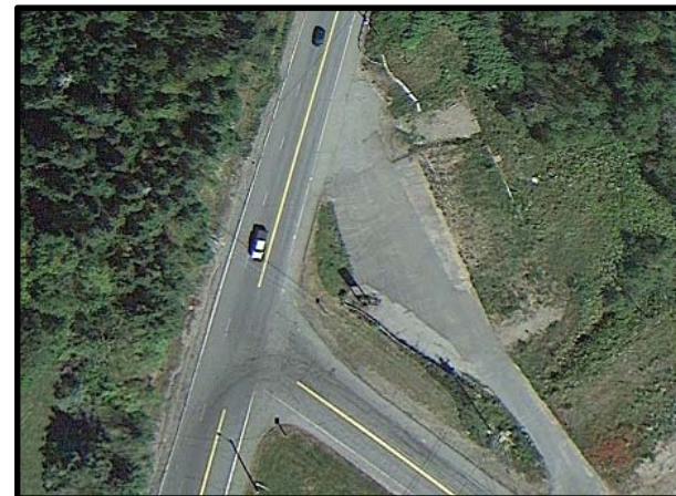
The building was demolished and the site is available for tribal reuse.